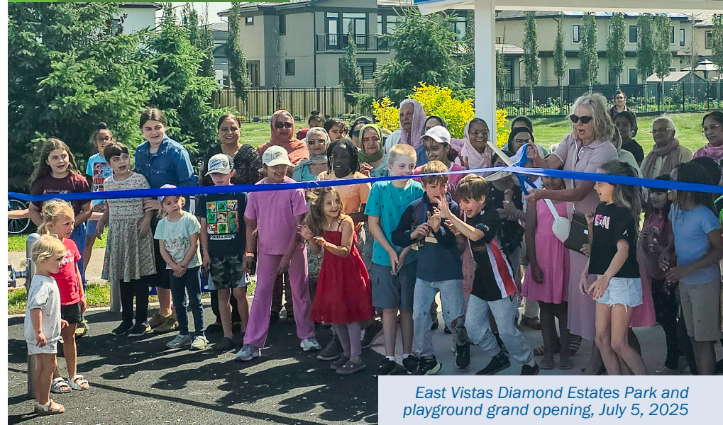
East Vistas Diamond Estates Park and playground grand opening, July 5, 2025