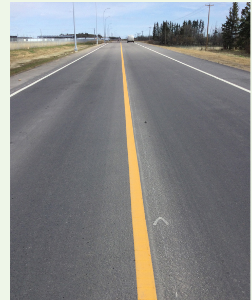
Nisku Spine Road