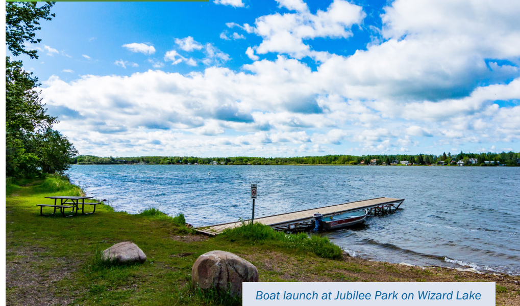
Boat launch at Jubilee Park on Wizard Lake