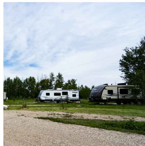
Centennial Park campground

If camping isn't your thing, we also have beautiful day-use parks for hiking, fishing, picnics and more. Everything you need to know can be found on our website.