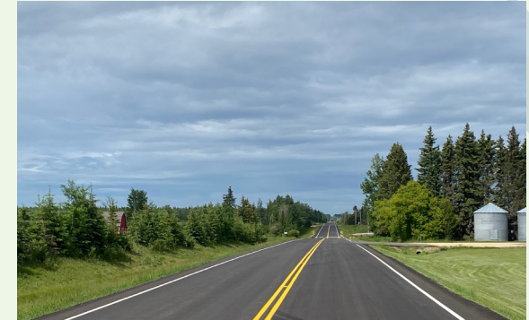
Glen Park Road east of Range Road 13

Nisku Spine Road , from Allard Avenue, Leduc, to Township Road 500 (65 Avenue, Leduc), was a joint cost-share project between the County and City of Leduc. Work was completed in 2024, which includes: