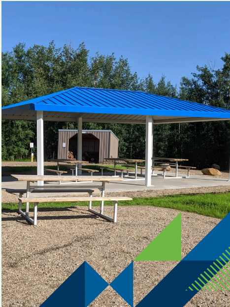
Genesee Park Group Campground

More information and booking: leduc-county.com/campgrounds