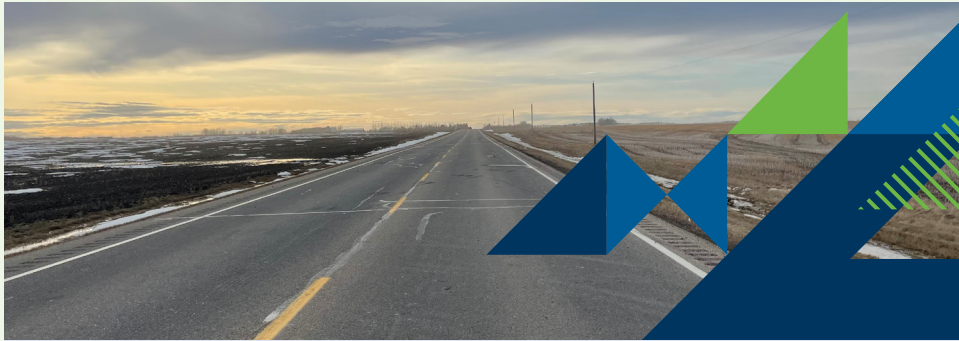
Glen Park Road in Leduc County

The bylaw would authorize Leduc County Council to borrow funds in the amount of $6,680,000 to finance the reconstruction of Glen Park Road between Range Road 263 and Highway 795 , between Highway 778 and Highway 39 , and between Range Road 251 to Highway 2 .