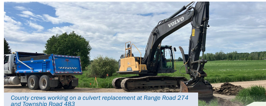
County crews working on a culvert replacement at Range Road 274 and Township Road 483

Work will continue throughout the rest of the year on projects such as culvert replacements, line painting, roadside ditching and asphalt repairs.