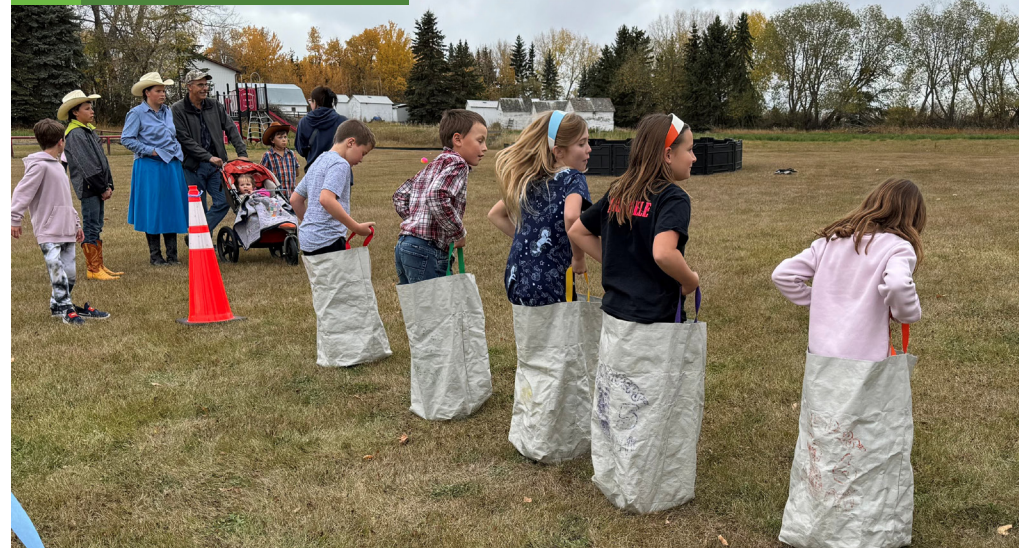
Kids playing at the Harvest Festival in Leduc County