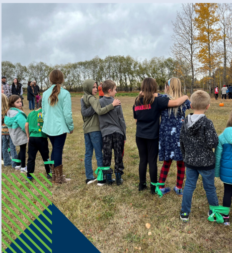
Harvest Festival in Leduc County

Learn more at leduc-county.com/recreation .