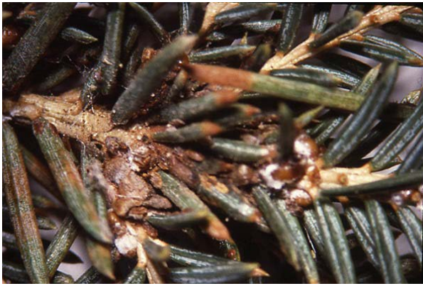
Spruce bud scale

Hosts: Colorado, Norway, white and black spruce