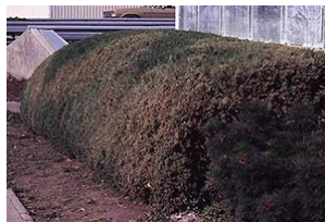
Spruce spider mite damage