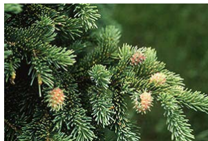
Spruce gall adelgids damage