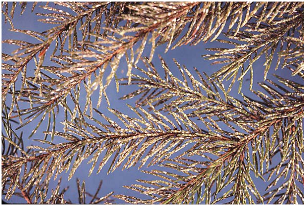
Pine needle scale