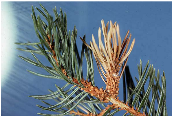
Spruce gall midge damage