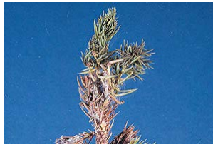
Spruce needle miner damage

Hosts: Colorado, Norway, white and Engelmann spruce