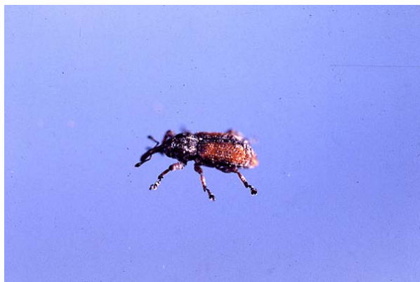
White pine weevil