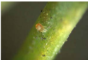
Spruce spider mite larvae