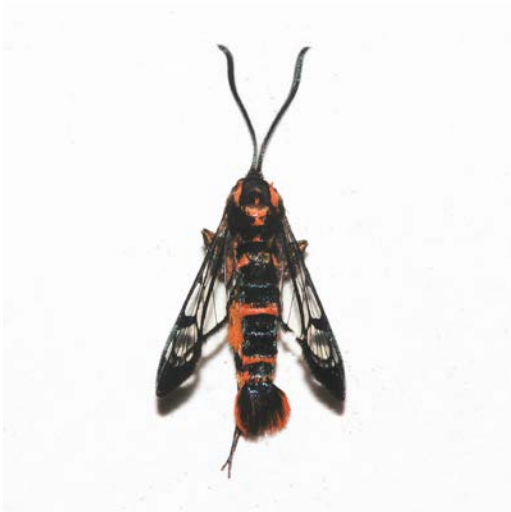
Douglas fir pitch moth

Hosts: Douglas fir, white spruce and pine