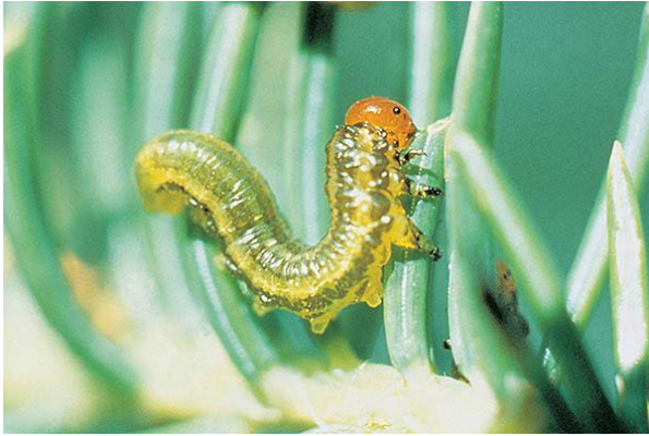
Yellowheaded spruce sawfly