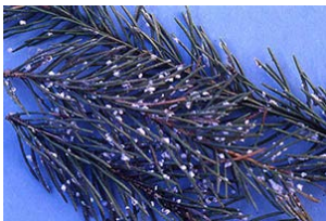
Spruce gall adelgids eggs